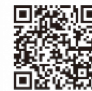
Healthy walking: "Kurort Path"